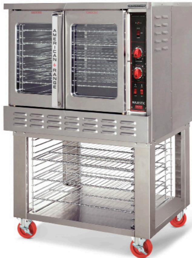
Model Shown MSD-1GG (Standard Depth)

Shown with optional casters and adjustable cooling / storage rack.