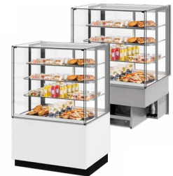
Models on underframe or drop-in version