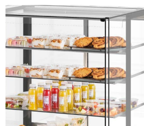
Maximum food visibility