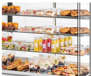
Four presentation levels