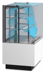
Patented Cold Booster technology