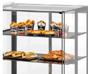
Maximum food visibility