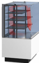
Hot Blanket holding technology