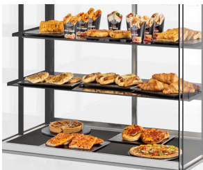
Three presentation levels