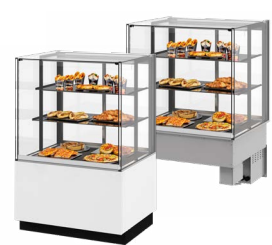
Models on underframe or drop-in version