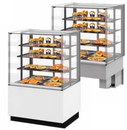
Models on underframe or drop-in version