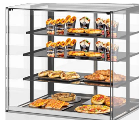
Maximum food visibility