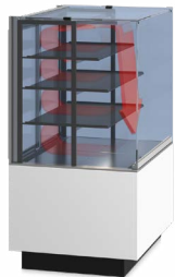
Hot Humidification technology