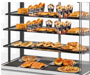
Four presentation levels

* Compared to the competition according to global ISO standards - TDA ISO 23953