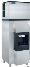
DHD 200-30 & *MS 880