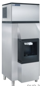
DHD 200-30 & *MS 440