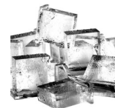
SPIKA Half Dice