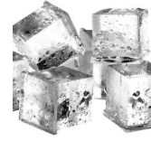
SPIKA Full Dice

*ITV's SPIKA MS 440 & MS 880 sold separately.