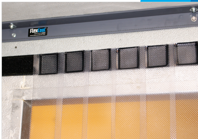
Installed FlexCool ® Curtain