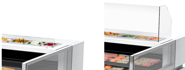
Low or high glass panel in front of ingredients