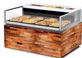
Customizable cladding and materials