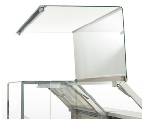
Lift-up glass opens in its own space