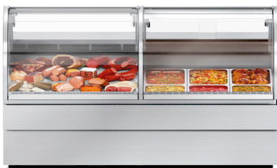
Hot & Cold in one integrated design