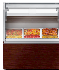
Customizable cladding and materials