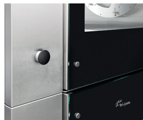
Rotor button on customer side