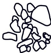
"Fine" Style Ice Flakes