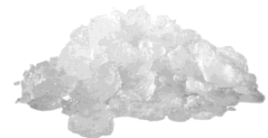
ICE QUEEN Flakes